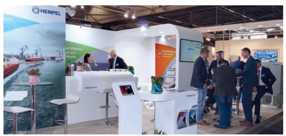
Hempel presents its coating systems in Rotterdam