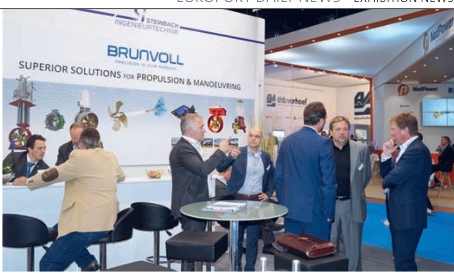
SI-Technik represents Brunvoll and MMC Green Technology in Rotterdam

Meanwhile, MMC Green Technology has won several contracts for its compact BWM system.